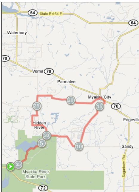
http://www.mapmyride.com/route/us/fl/myakka%20river%20state%20park/184933943971 36 Mile

Parking: Use the parking area on the left located one tenth mile from the entrance station. Do NOT use the Visitor Center parking lot.